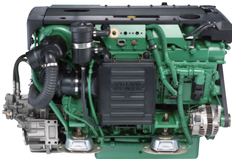
D4-210 with HS45AE reverse gear

Volvo Penta's new 4-cylinder D4-210 is developed from the latest design in modern diesel technology. The engine has common rail fuel injection system, double overhead camshafts, 4 valves per cylinder, turbocharger and aftercooler. Together with a large swept volume and the EVC system (Electronic Vessel Control), this results in world-class diesel performance, combined with low emissions.