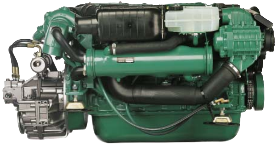
KAMD300 with HS63AE reverse gear

The engine is compact, and has an advantageous weight to power ratio making it excellent for both single- and multi-engine installation in planing craft.